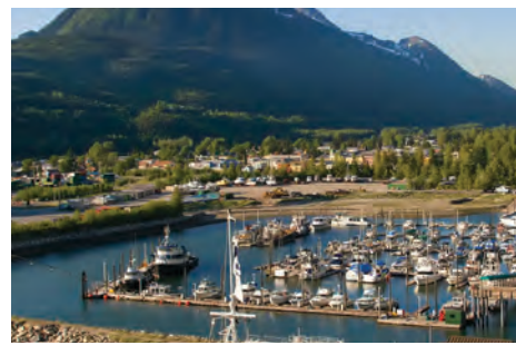
Skagway Boat Harbour

Board our coach for Butchart Gardens. For over 90 years this amazing 50 acre garden has been a symbol of Victoria's beauty. We will also stop at the Butterfly Gardens today.