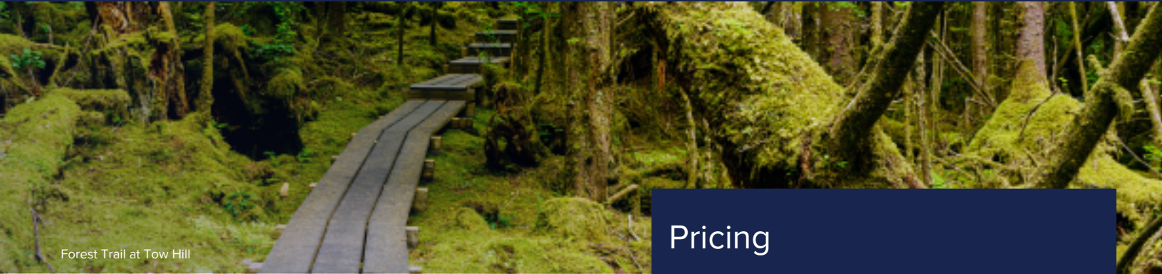
Forest Trail at Tow Hill

rolling stock and heritage buildings that were used in rail lines that pass through or are connected to central BC. These include: the Grand Trunk Pacific Railway, Canadian National Railway, Pacific Great Eastern Railway and BC Rail.