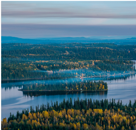
Prince Rupert Area

Say goodbye to your fellow travellers this morning as the coach departs Edmonton for Regina, via Saskatoon with drop offs along the way.