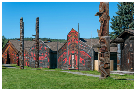
Ksan Historical Village & Museum

Today, cross the British Columbia border and view Mount Robson, which has the highest peak in the Canadian Rockies. Continue along to Prince George enjoying the beautiful scenery.