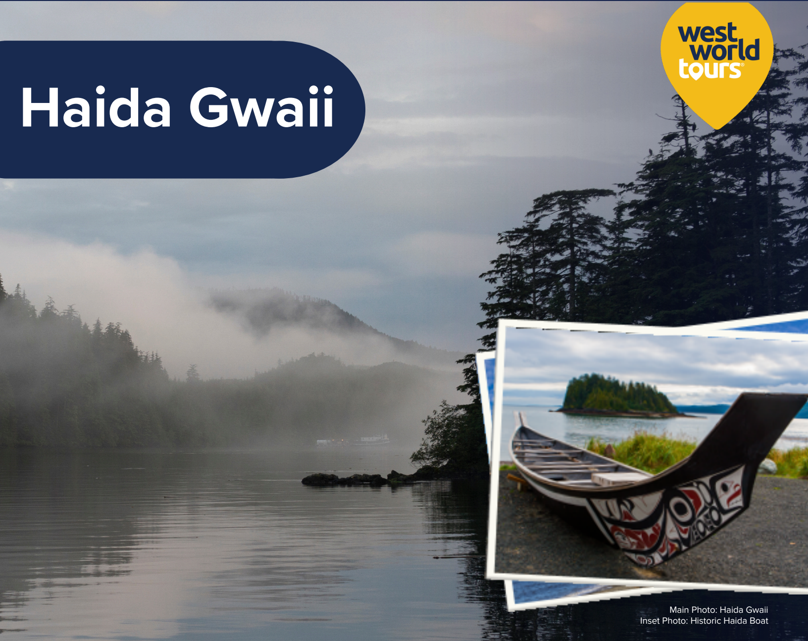
Main Photo: Haida Gwaii Inset Photo: Historic Haida Boat